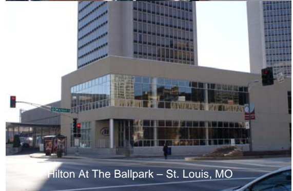
Hilton At The Ballpark – St. Louis, MO