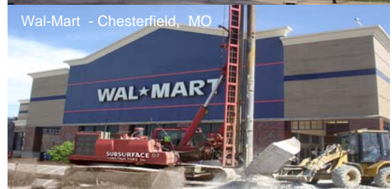
Wal-Mart - Chesterfield, MO