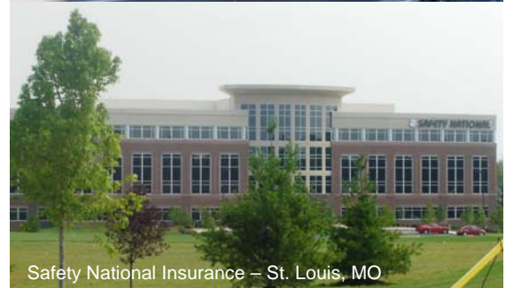
Safety National Insurance – St. Louis, MO