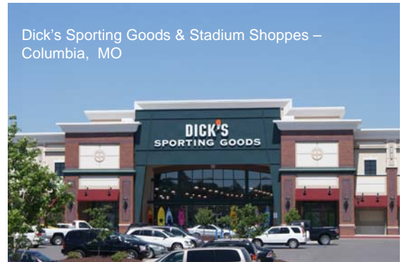
Dick's Sporting Goods & Stadium Shoppes – Columbia, MO